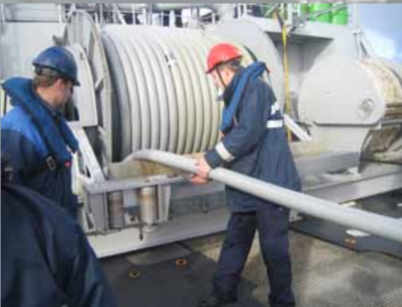
Quad Array Deployment

This Quad array can also be employed as the detection mechanism for incoming torpedoes. In this case the left-right ambiguity resolution allows the operator to optimally deploy countermeasures against the torpedoes.