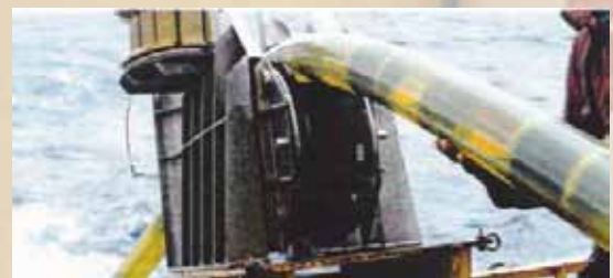
Horizontal Projector Array Housing Flextensional Transducers