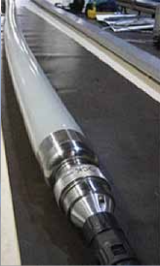
Flexible Tow Body

Ultra Electronics is the world leader in torpedo defence with systems currently operational with the UK Royal Navy and about to enter service with the Turkish Navy. Ultra's torpedo defence technology has been extensively trialed by the US Navy and has been selected for use on their new Littoral Combat Ships. With the ability to detect and classify all known torpedoes, including those with advanced countermeasures, Ultra offers a combined expendable and towed countermeasure system to decoy and jam incoming acoustic torpedoes. Using pneumatic launchers to deploy Expendable Acoustic Devices (EADs) in programmable acoustic decoy patterns, Ultra's torpedo countermeasure is easily fitted on most warships and avoids the inherent safety issues associated with explosive launched systems. A flexible towed body is available for export to select countries and permits an active countermeasure jammer to be towed in-line with the active-passive towed receive array. This eliminates the need for a separate winch and handling system normally associated with stand alone towed countermeasures such as Nixie.