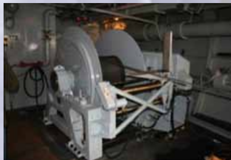
High Speed Winch and Handling System

Ultra Electronics is able to supply a wide range of Winch and Handling Systems in order to meet the operational needs of the end user. Designed as stand-alone systems that easily and seamlessly integrate into the ship structure, Ultra Electronics' lightweight Winch and Handling Systems require only electrical power and cooling water for operation. These systems range from simple, low cost implementations that require personnel in the winch room to effect deployment to fully automated, high-speed systems that can be controlled from the Combat Information Centre. In all instances, extensive use of commercial and military off-the-shelf components ensure a robust and reliable implementation allowing for trouble free operation in the most demanding of environments.